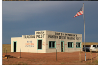
The Rise, Fall, and Rise of the Painted Desert Trading Post. Top: When operating in 1945. Middle: Seventy-three years later in 2018. Bottom: After a three year repair and stabilization project completed in 2021.