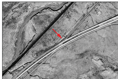
This 1962 aerial photo shows the point where 2-lane US 66 joined westbound I-40 following completion of the interstate in this area (see black arrow above left on map).