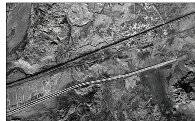
This 1962 aerial shows the end of eastward I-40 progress toward Gallup (arrow at top right of map).