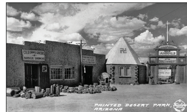
The Painted Desert Park Trading Post, also known as The Lion Farm, during its heyday just east of the original entrance to the Painted Desert on US 66 (green/red route).

This 1950s temporary road was used for park access from the orange route while a permanent entrance was built just to the west. It also provided continued access to the Painted Desert Park Trading Post.