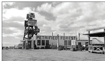
The Painted Desert Tower, which was located on US 66 just west of the original Painted Desert Park entrance (green/red route).