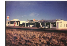
Rocky's in the 1950s, with a cafe, gas station, liquor store, and wrecker service. Unsourced photo.