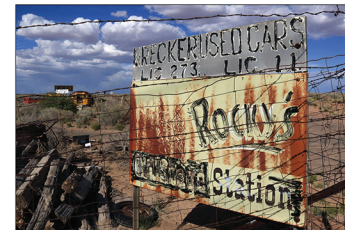
The site of Rocky's in 2021, abandoned alongside I-40 since the passing of Nyal Rockwell in 1998.

Note: Both drainage structures on this map are culverts.