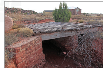
The stone and timber bridge at Cuervo on the original route.