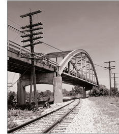
1939 RR Bridge (arrow at left).