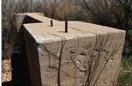
This pier (left center of top photo) is all that remains of the first Cottonwood Wash Bridge.