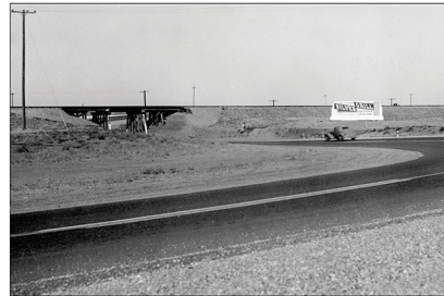
A 1930s coupe passes a billboard as it navigates the S-curve beneath the RR at Hill Dr. west of Amarillo (below).

Note: In 1949, plans got underway to eliminate the dangerous RR underpass on the green/red route with the new 4-lane, which would originate in Bushland (next map) and proceed eastward into Amarillo (previous map). This project was completed in 1954. The RR is now abandoned and the underpass has been filled in. Only a trace of pavement on the curve next to Hill Dr. survives.