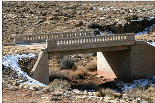
The abandoned Cow Canyon Bridge on original US 66.