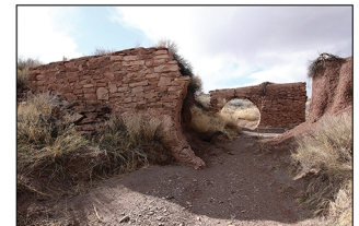
At roughly eight feet in height, this massive culvert was built for the National Old Trails Road and later adopted by the original path of US 66 (upper right edge of map).