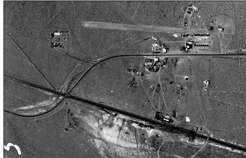
Amboy in 1953. Several of the businesses originally positioned along the green route either closed or moved to the red route in the 1930s.