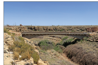
The 1914 Luten Arch Bridge on Canyon Diablo at Two Guns remains in place.