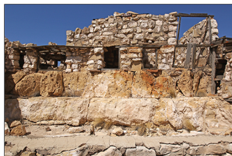
Ruins of the first Two Guns zoo (arrow above), with the canyon ledge in the foreground.

Orange: Upgrade 2-lane alignment to the red route, inspiring another phase of Two Guns expansion. This occurred only a decade after initial paving, possibly because of the narrow arch bridge on the red route. The orange route, as well as part of the red route here, was later adopted by eastbound I-40.