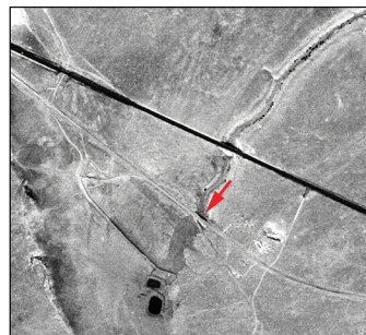
A drainage structure of undetermined type was once part of the red route at Babbitt's Tank, as seen on this 1954 aerial photograph. No trace of it remains.

Note: The WB I-40 bridge here was built in 1970. The EB bridge was built in 2010, replacing the 1940s orange route bridge.