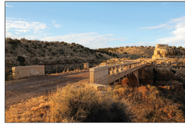
Similar views of the 1914 Canyon Padre Luten Arch Bridge taken more than 100 years apart. Note the falseworks still in place under the bridge as it neared completion in the vintage photo. Historic 1914 photo © Don Gray.