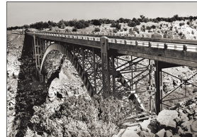
The 1937 steel arch bridge on Canyon Padre built for the orange route and later adopted by EB I-40. Arizona Highways.

Const. road has a ROW marker, possibly for the interstate.