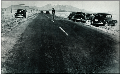
The site of this accident was on US 66 a few miles east of Winona (next map). View is to the west, with the San Francisco Peaks in the background.