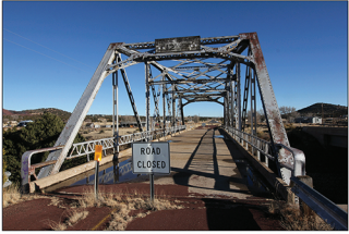
The Walnut Canyon Bridge (upper left on map) photographed about 75 years apart.

Between Winslow (east) and Flagstaff (west)