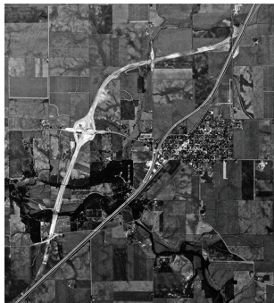
Construction of the I-55 bypass at Lexington was underway in 1974.

Blue: Lanes added in the 1950s to create a 4-lane roadway.