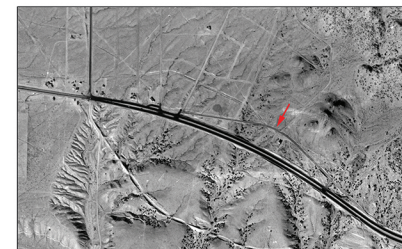
Part of the bypassed 2-lane alignment seen in this 1951 aerial photo (red arrow) remains in place.

Blue: Lanes added (upper part of map) in the early 1950s to create a 4-lane highway. On the lower portion of the map, all new lanes were built along the path of future I-40. The blue route became undivided where it joined the orange route entering Albuquerque on Central Ave. at Tramway (photo below).