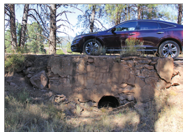
One of the culverts on the green route (above) built for the National Old Trails Road and later adopted by US 66.

Note: The green route follows the forest road where the culverts are located and not the dirt road immediately next to the RR tracks.