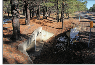
East view of the culvert where the red and orange routes merge at Parks.

Note: It is possible that the green route here followed the same path as the red route to their point of merging on this end of the map.