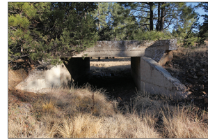
The short span on the green route likely predates US 66. Concrete guardrails that curve outward on the ends make it unique.