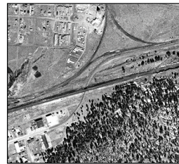
A 1954 aerial photograph shows the RR underpass for US 66 (red) prior to its replacement with the orange route overhead.

Note: Williams was the last city on the route to be bypassed by I-40, holding out through litigation until 1984. East and west of there, the interstate had been completed since the 1960s.