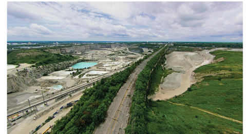
Westward view of abandoned US 66 at the Vulcan Materials quarry.

Throughout a large part of the 20th century, quarry operations at Vulcan Materials Company gradually eroded the land along both sides of old US 66 until the roadbed became unstable and was closed to traffic, with motorists directed onto a detour following 55th St. and East Ave. A 2001 lawsuit brought by the State of Illinois resulted in a settlement, though Vulcan has never admitted responsibility. It is unlikely that this barricaded one-mile section of the route will ever reopen.