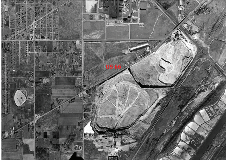
1951 aerial view shows the Vulcan Materials quarry before any digging was done on the north side of US 66. Note the 66 Drive-In Theater at left center of photo.