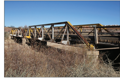
The abandoned 1923 Rio Puerco Bridge at Sanders remains in place.

Between Lupton (east) and Holbrook (west)