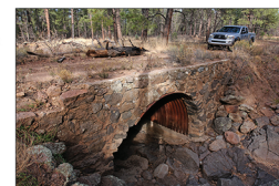
The stone culvert on the green route was built for the NOTR and later adopted by US 66.

Continuation of the previous map begins here.