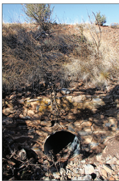
A high embankment was built on top of this stone and tinhorn culvert on the green route to circumvent a ravine. This alignment of the NOTR was improved when US 66 was paved (red).