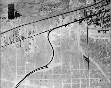
Eastbound I-15 traffic is channeled back onto US 66 on Barstow's west side in this 1959 aerial photo. This location would become Exit 181 (above).