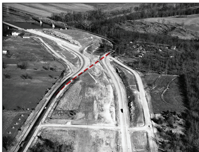
Easterly 1950s view of the 4-lane under construction. The original alignment of US 66 (dashed red line) was cut to create the westbound half of the 4-lane. The road on the far right was added (gray on the map above). The Eden Resort is seen in the upper right and the Gasconade River in the upper left.

Note: In 2019, a new Gasconade River Bridge was built between the I-44 bridges and the 1924 steel truss bridge to carry service road traffic (gray line between the existing bridges). The older bridge is closed and is highly endangered.