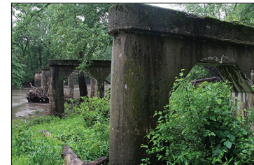
Ruins of the bridge that replaced the two spans on the Salt Creek overflow (photo below).