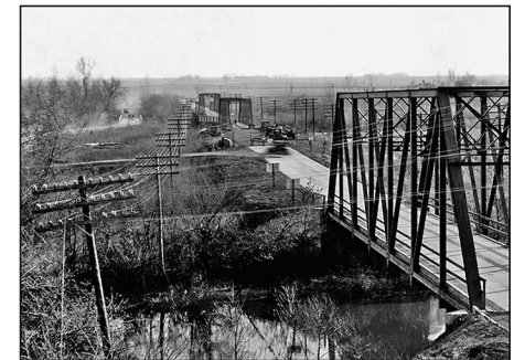
Salt Creek Bridge (foreground); overflow bridges (background); and detour (upper left).