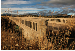
The first US 66 bridge over the RR (red route) was built circa 1930.