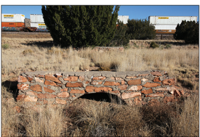
Built for the National Old Trails Road, this culvert was adopted by US 66 (green route) in 1926.

Note: The three stone and tinhorn culverts on the green route were originally built for the National Old Trails Road.