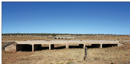
The culvert on the red route (foreground) and the culvert on the orange route (background) are almost identical, even though they were built about 25 years apart.