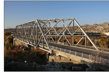
The 1930 Mojave River Bridge (upper left) allowed for a sharp curve to be removed where the previous bridge had stood.