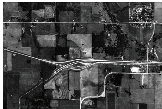
1964 aerial view of I-44 Exit 57, which connected with the upgrade alignment of US 66 (orange on map). To the east, US 66 signage was moved onto the interstate. Continuing westward, I-44 would be extended by 1968 but would not carry US 66 traffic, which remained on today's MO 96 to Joplin.

I-44: In place as far as Exit 57 by 1962, and brought up to interstate standards by 1964. On the 1962 state highway map, US 66 signage has been removed from the original alignment. I-44 is not color coded because it was not a US 66 project and did not involve an existing US 66 alignment.