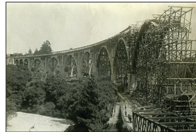
Colorado St. Bridge under construction.

Turquoise (west on Colorado from Figueroa, bottom part of map): A Temporary construction route westward to Eagle Rock Blvd. from 1934-1936, while improvements were made on Figueroa.