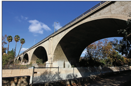
The imposing 1912 York Blvd. Bridge on the red route.