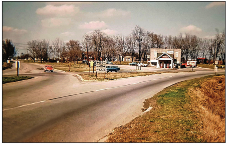
Pre-interstate view looking north at the junction of US 66/US 40 and IL 159 (below). Unsourced Photo.

Note: The dashed gray lines above identify the original pathways of former IL 11 (on Collinsville Rd. and then Troy Rd.) and US 40, which followed the WB lanes of the future interstate.