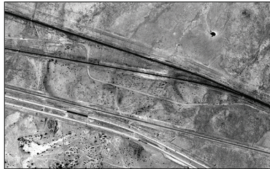
This 1971 aerial photo provides a clear view of the original path of US 66 prior to paving and its point of crossing to the north side of the RR, where it remained all the way to Iyanbito (Map 102).