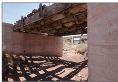
The bridge ruin identified on the map below. View is toward I-40, which is beyond the RR trestle.

Continuation of the previous map begins here.