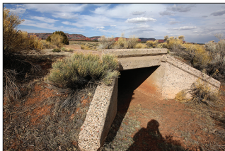
Example of a typical box culvert marking the original alignment north of the RR.