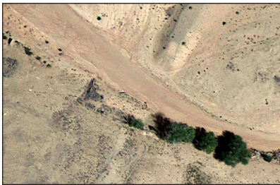
2013 computer aerial screen shot

NOTE: Acknowledgment of a drainage structure on the 1926 route between Hwy. 22 and I-25 (west of Santo Domingo) here: 35.4803,-106.336131. A second structure exists farther west, approx. 1 mi. eastward from the Jct. with I-25 here: 35.469012,-106.34496. It is also possible that sand has covered additional culverts or low-water crossings on the arroyos in this area.