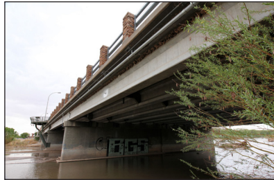
1983 bridge (2013 photo)

29. Rio Puerco Bridge west of Albuquerque on the 1937 alignment.