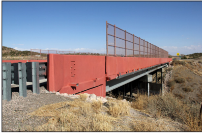
2013 view of the 1955 RR Viaduct