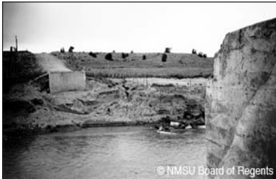
Following the 1937 flood