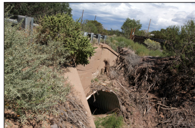
2013 (tinhorn B)

NOTE: Acknowledgment of two Low-water Crossings on the west side of I-25 (both inaccessible) located here: 35.565295,-105.888862; and here: 35.572187,-105.897516