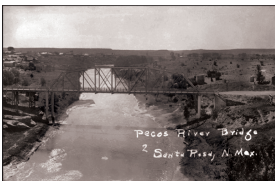
1st Route 66 Bridge