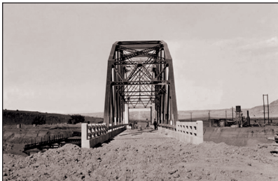
1933 construction photo