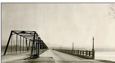
Barelas Bridge A (National Hispanic Cultural Center (Albuquerque, NM)

Coordinates: 35.069802,-106.65983; 34.906346,-106.685021; and 34.804536,-106.717851