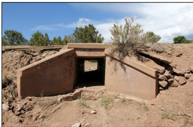
2013 (culvert A)

Coordinates: A = 35.548061,-105.834239; B = 35.547403,-105.837244; C = 35.54282,-105.846023