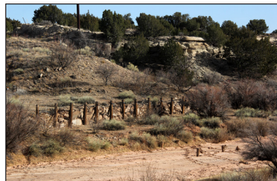
2013 (remains of earlier bridge)

NOTE: The next listed bridge replaced a 1930s bridge built at the same time as the above entry. It also was replaced in 1952, and again in 2021.