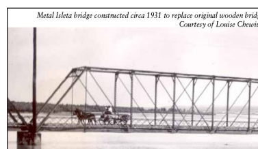
1931 Isleta Bridge