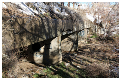
2013 (built when road was widened)