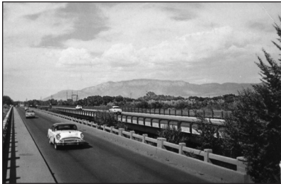
1930s bridges (WB bridge in foreground)