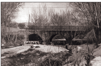
Circa 1930